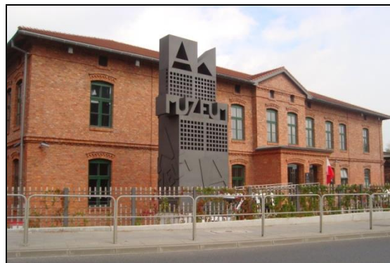
Fig. 11. The Gen. Emil Fieldorf Nil Home Army Museum in Krakow