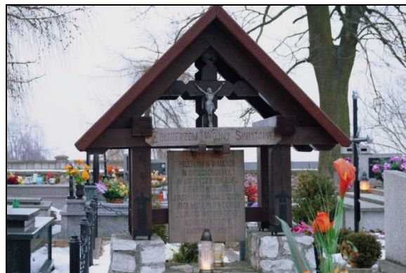
Fig. 4. War quarter at the parish cemetery in Skala