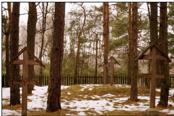
Fig. 3. Ogonów war cemetery in Kaliś