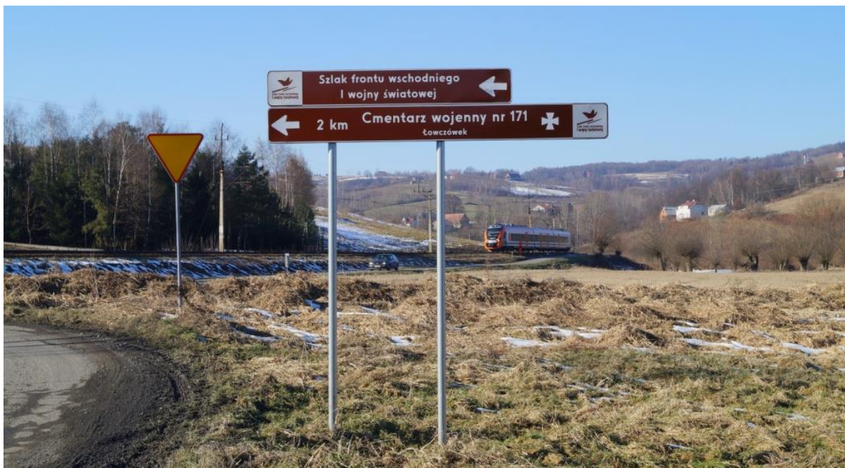
Fig. 2. Marking of the Trail of the Eastern Front of the World War I in the field