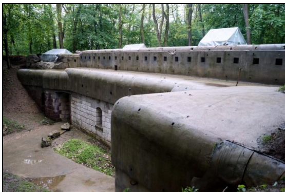
Fig. 10. Fort Tonie