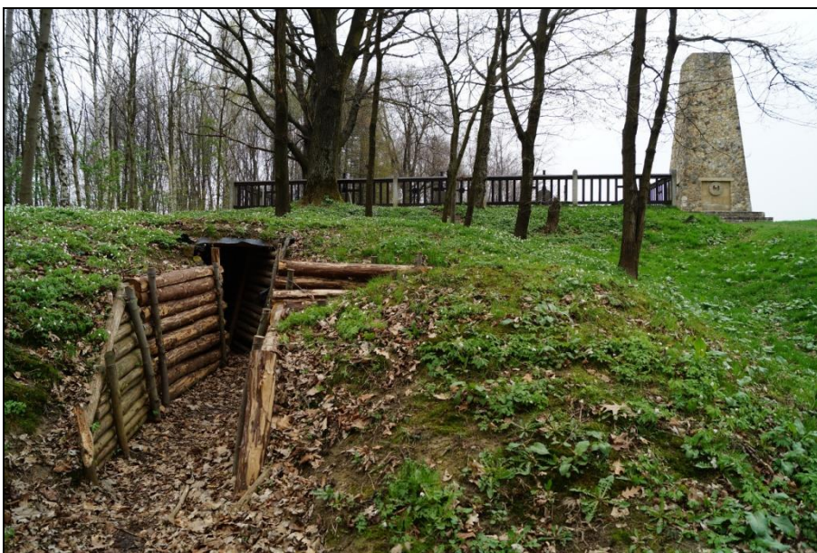
Fig. 7. Strengthened ground next to the military cemetery No. 193 in Dąbrówka Szczepanowska

Another group of the facilities on the trail there are, referring to the events of World War I and originating from different years and periods, monuments (Table 2). The oldest of these is the obelisk on the Kaim hill in Krakow, dating from 1915, which commemorates the refutation of the Russian offensive on 6 December 1914 (Fig. 8). Another category of attractions constitute residential buildings (Table 3; Fig. 9), and among them the historical places of residence of Jozef Pilsudski and its squads. These buildings, due to their present functions, are not open to the public.