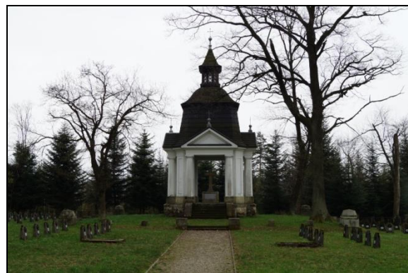
Fig. 6. War Cemetery No. 192 in Lubinka Source: Photo. Elżbieta Stach (2015)