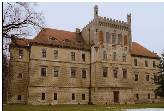
Fig. 9. Palace in Mirów