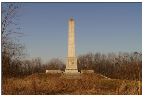
Fig. 8. The obelisk on the Kaim hill