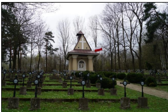
Fig. 5. War Cemetery No. 171 in Łowczówek