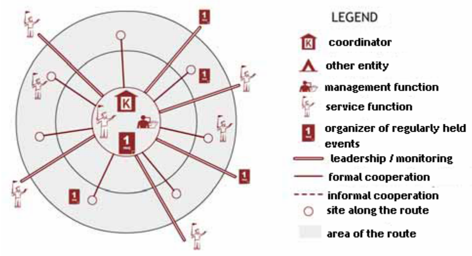
Figure 1. Unified model of thematic route coordination

Examples in the group of analyzed routes : German Fairy Tale Route, Bregenz Cheese Route, Piast Route.